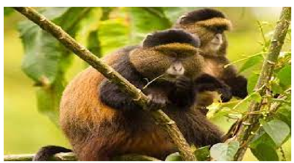
Day 4: Golden Monkey Tracking

This morning, you will depart very early with your drive to Volcanoes National Park after Breakfast again at 6:30am you will drive to RDB's Office for