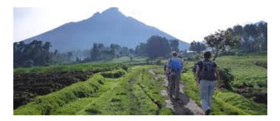
Day 3: Bisoke Crater Lake Hikes

After breakfast your driver guide will pick you start your trip to Volcano National park for hike of one of Dormant Volcanoes with very good view of the Volcanoes which can take between 5-6 Hrs. Hiking, thereafter back at the Hotel for Dinner and overnight stay.