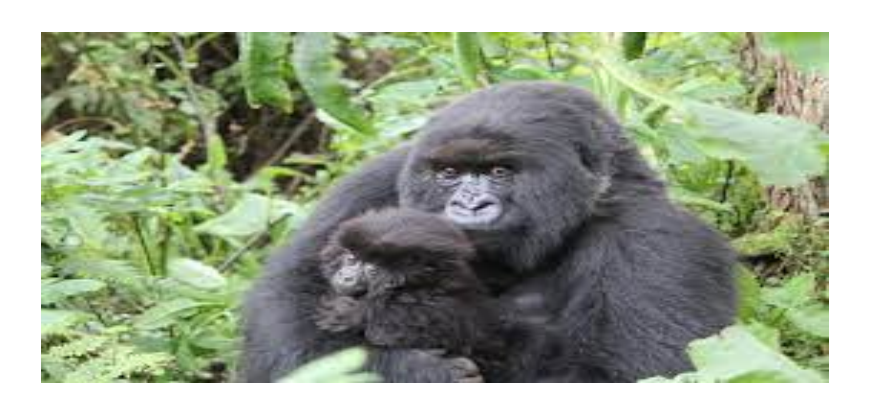
Day 2: Volcanoes National Park for Gorilla Tracking

Day one of gorilla trekking: track mountain gorillas in Volcanoes National Park, with a strenuous, hours-long hike to view the creatures for one magical hour. Spend a relaxing afternoon at leisure visiting the farmlands, villages, and markets that surround Kinigi and Musanze towns. A walk or drive along these rural roads is where one can really enjoy Rwanda's street culture, with a fascinating blend of farmers, businessmen, bars, and shops