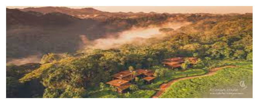
<u>Stay:</u> Nyungwe House (Luxurious) or Nyungwe Top View Lodge (Middle Lodge)

your Golden Monkey tracking, (takes 2 to 4 hours) after descend and back to your Hotel for Lunch and Drive back to the Hotel for Lunch and after Visit of Dian Fossey Research center to Explore how she changed Life of Gorilla from unhabituated to Habituated, after driver to Kibuye via Gisenyi and stay at Nyungwe House/Nyungwe Top View Lodge